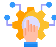
Integrated Vulnerability Management